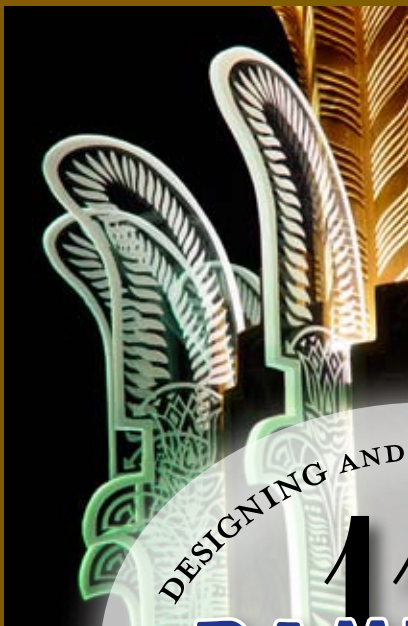
Fred F. French Building Lobby, New York, NY