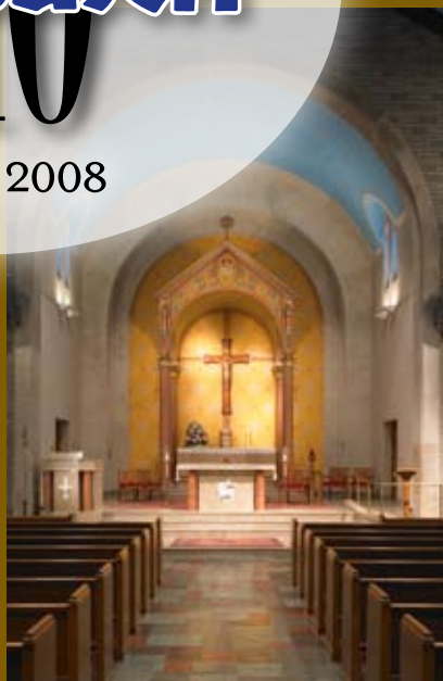
St. Margaret Mary Church, Irondequoit, NY