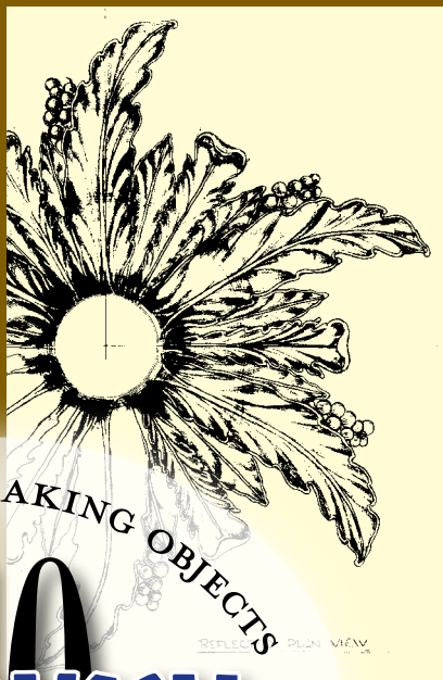
Boston Public Library, Boston, MA